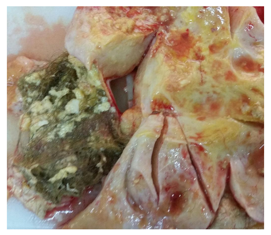
Figure 2. Admixture of sebum, hair within cavity of ovarian mass