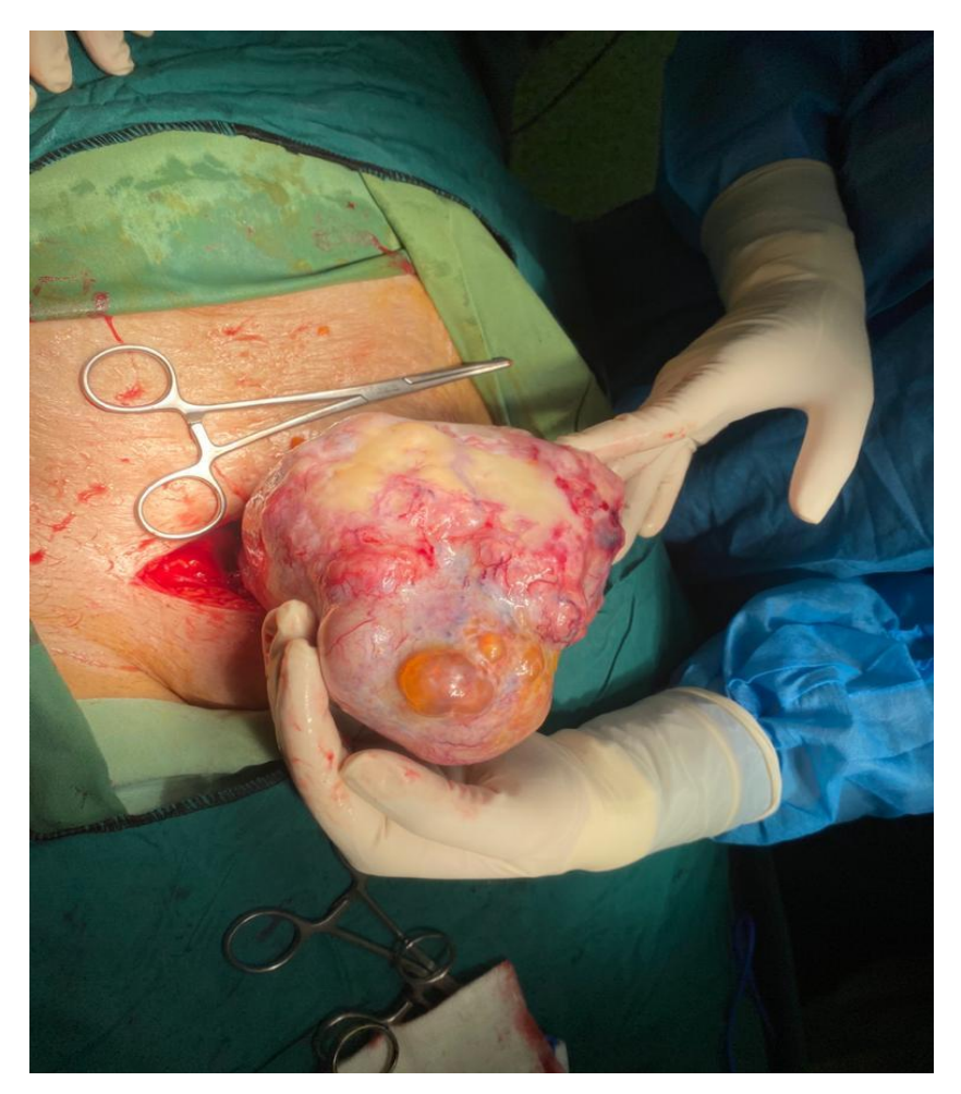
Figure 1. Irregular-shaped mass containing multiple cysts and adipose tissue