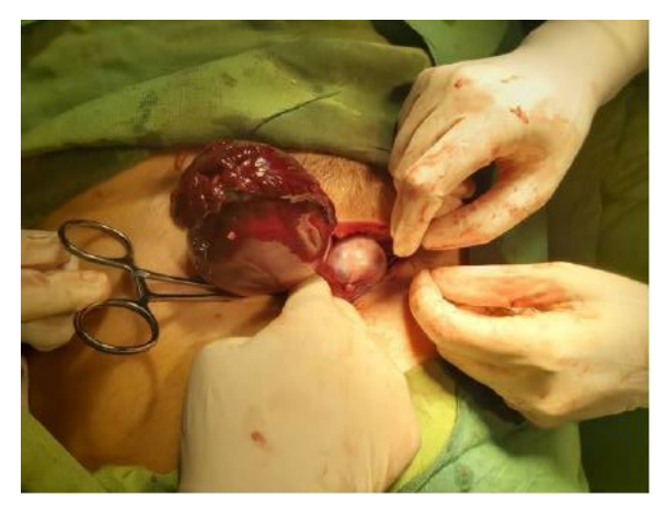
Figure 1. Isolated torsion of the right fallopian tube with hydrosalpinx and intact ovary

Pathologist evaluation revealed the multi-loculated cystic lesion with ciliated flat to cuboidal cell lining accompanied by extensive bleeding in the cyst wall, compatible with benign serous cystadenoma with extensive bleeding. Still, because of finding an intact ovary during surgery, a re-evaluation of the specimen by another pathologist was requested, which revealed that the origin of the resected cyst was a fallopian tube. The postoperative period was uneventful, and the patient was discharged from the hospital two days after surgery.